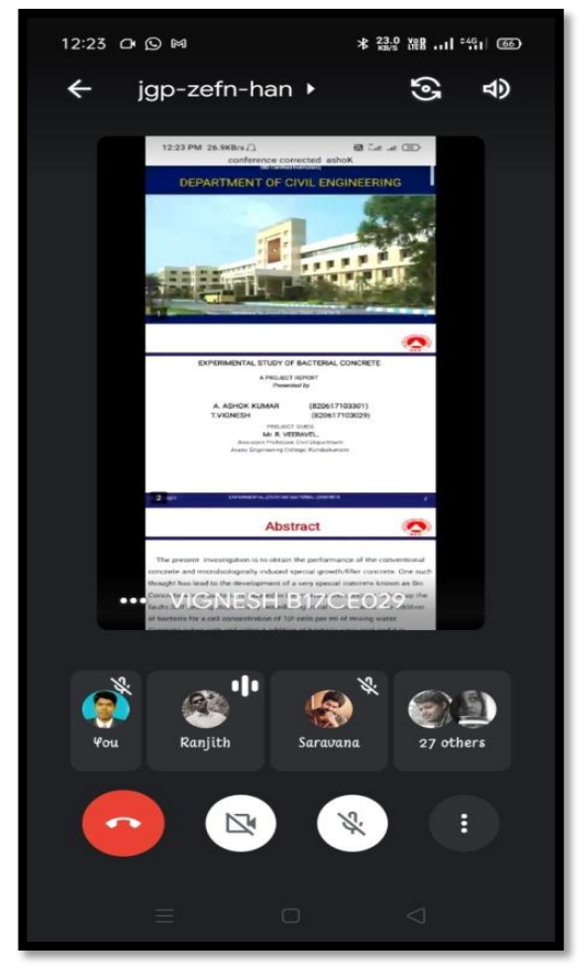
Technical Session - Student Presentation